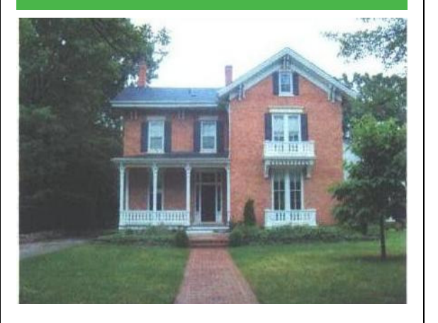
DAVID C. THATCHER HOUSE. (1858)