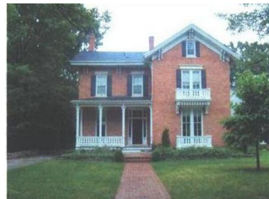
DAVID C. THATCHER HOUSE. (1858)