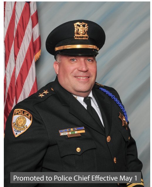
Promoted to Police Chief Effective May 1

What position do you currently hold and why would residents reach out to you? I am the Deputy Chief of Police. My goal is to foster strong relationships between the Department and the community. Residents might come to me with concerns about public safety, crime prevention, traffic enforcement, or neighborhood issues. I also handle questions about police policies, community outreach programs, and emergency preparedness.