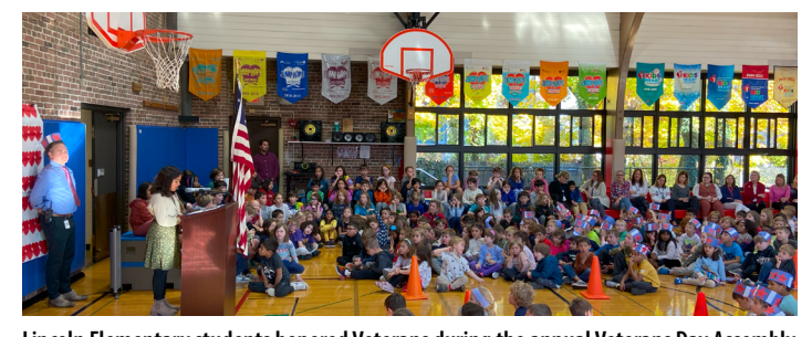
Lincoln Elementary students honored Veterans during the annual Veterans Day Assembly on November 13.