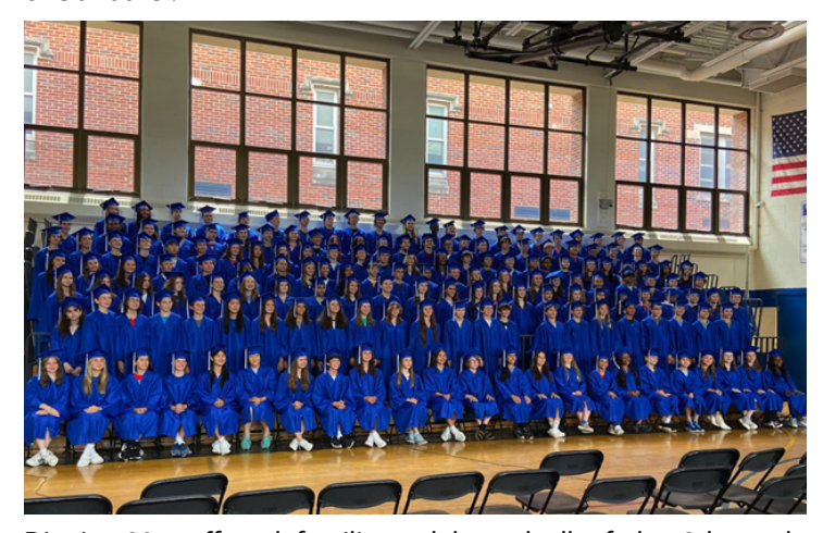
District 90 staff and families celebrated all of the 8th grade graduates during the Roosevelt Middle School Commencement Exercises in early June. Ahead of the ceremony, the class gathered with caps and gowns for a full-class photo in the North Gym.