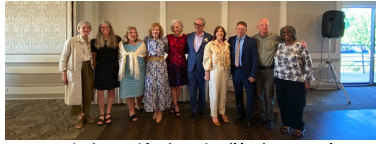
District 90 also honored faculty and staff for their years of service during the June Recognition and Retirement Celebration.